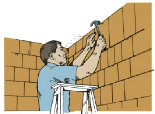
Figure 19: Top Course

The interior Certi-label Western Cedar shingles or shakes can now be finished to suit almost any taste. Contact a reputable finish manufacturer for more details.