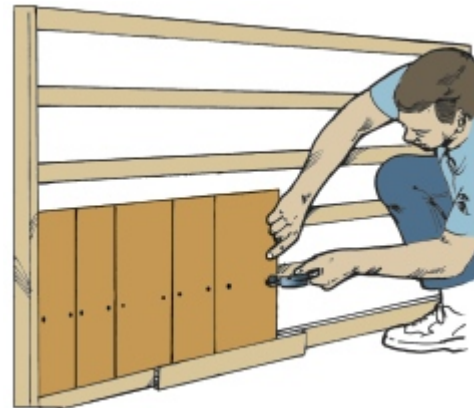
Figure 17: Starter Course